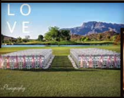
Exclusive Bridge Ceremony site including full set-up & coordination