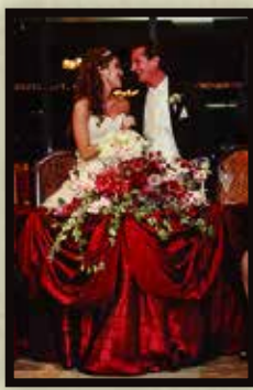
Bridal Floral Package